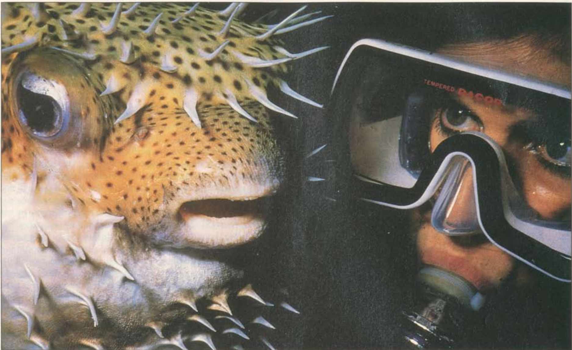
A delicate bee-stung mouth and liquid black eyes: face-to-face with a porcupine fish

Souse in the little park next to the basketball court and had bowls of souse and slices of johnnycake under the covetous stares of the town's mongrel dogs. Santa Claus came to the Souse, too, sweating in his red suit and fishing boots, giving gifts to every child. He had a vaguely familiar face. "Santa's going skin diving later," he told me.